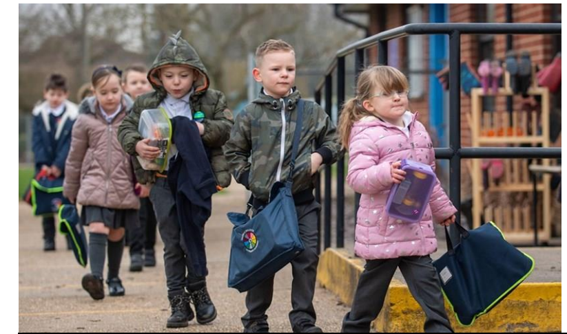
Pupils arrive at Thomas Bullock C of E Primary Academy, Shipdham.

As many children returned to school on Monday for the first time after nine weeks of lockdown, the Government announced £79 million for children's mental health — but this was only a fraction of the amount needed to meet the rising demand, the Children's Society said.