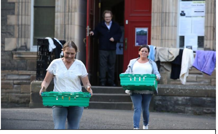
Volunteers from the Step to Hope charity carry food parcels into the grounds of the Parish Church of St Cuthbert in Edinburgh, last May, to distribute to the community

Of the estimated 12.4 million people who volunteered during the pandemic, 4.6 million people were volunteering for the first time. Of these, 770,000 were aged between 18 and 24 years old; 360,000 had a disability or long-term illness; and 740,000 lived in the poorest fifth of neighbourhoods in the UK —