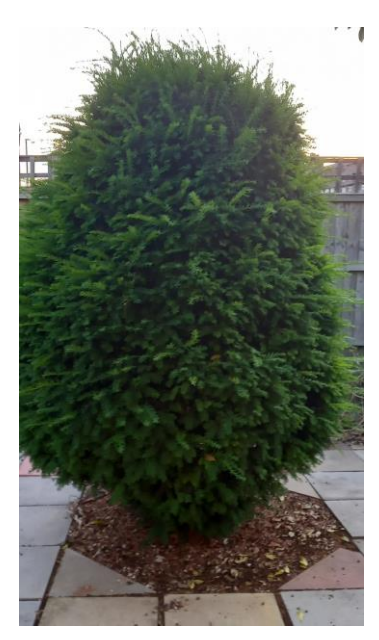
The Millennium Yew