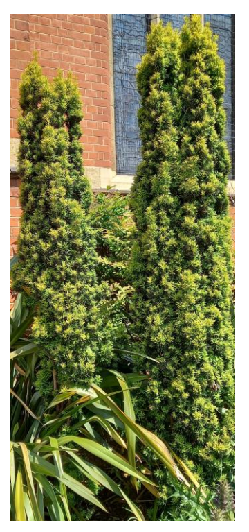
Above left: Silver Birch Above right: Irish Yew