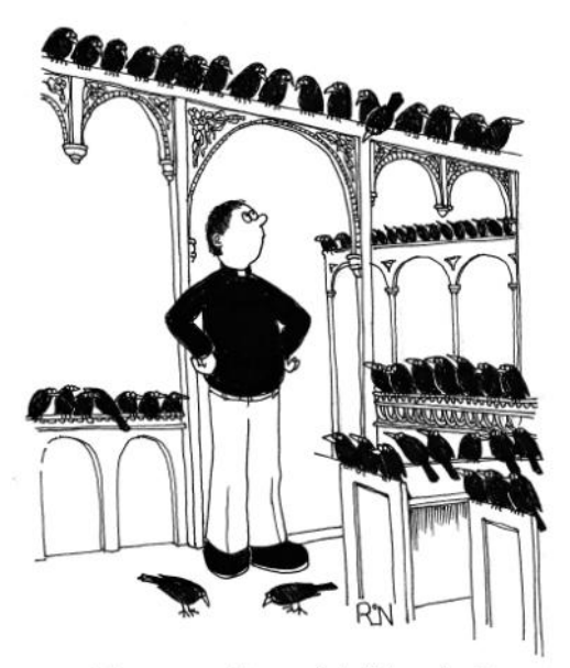
Where was the social distancing?